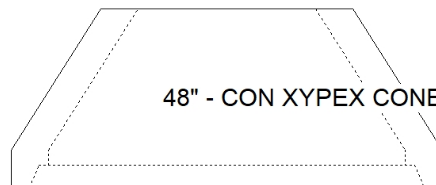
48" - CON XYPEX CONE w/24" HOLE F/G - 24" - (P3)